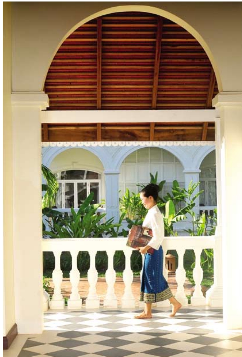
Above: A contemporary reflection of life in the French colonial era.

Tasty local delicacies created from favourite Asian recipes together with the signature dishes of a French brasserie are served at the Residence's 'La Belle Epoque' restaurant, followed by après-le-dîner absinthe cocktails, which can be enjoyed in '1861' – the terrace bar. The colonial era furnishings in this cosy lounge and terrace include studded leather sofas, marble tables and traditional bistro chairs. A library 'fumoir' corner adds to the intimate ambience, and during cooler months, the bar is warmed by a fire within a marble fireplace. The bar was named '1861' in honour of Mouhot; this remarkable man arrived in Luang Prabang on the 25 th July of that year, and sadly died of malaria just four months later. At Luang Say Residence, however, a piece of his extraordinary life has been captured, ensuring that his memory will continue to live on. FRV